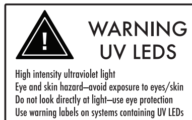
Example UV warning label

Warning labels should be placed outside access panels and doors to the UVC source as well as panels or doors to adjacent areas where UVC radiation may penetrate or be reflected.